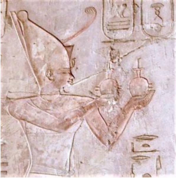
The earliest records of a psychological experiment go all the way back to the Pharaoh Psamtik I of Egypt in the 7th Century B.C.

Psychology is an exciting field and the history of psychology offers the opportunity to make sense of how it has grown and developed. The history of psychology also provides perspective. Rather than a dry collection of names and dates, the history of psychology tells us about the important intersection of time and place that defines who we are. Consider what happens when you meet someone for the first time. The conversation usually begins with a series of questions such as, “Where did you grow up?” “How long have you lived here?” “Where did you go to school?” The importance of history in defining who we are cannot be overstated. Whether you are seeing a physician, talking with a counselor, or applying for a job, everything begins with a history. The same is true for studying the history of psychology; getting a history of the field helps to make sense of where we are and how we got here.