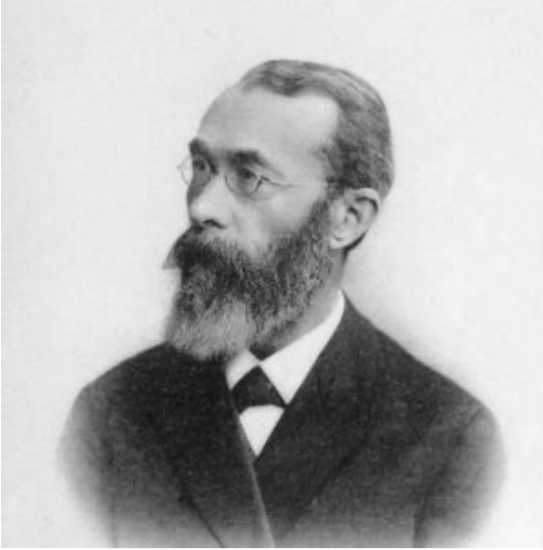
Wilhelm Wundt is considered one of the founding figures of modern psychology.

The formal development of modern psychology is usually credited to the work of German physician, physiologist, and philosopher Wilhelm Wundt (1832–1920). Wundt helped to establish the field of experimental psychology by serving as a strong promoter of the idea that psychology could be an experimental field and by providing classes, textbooks, and a laboratory for training students. In 1875, he joined the faculty at the University of Leipzig and quickly began to make plans for the creation of a program of experimental psychology. In 1879, he complemented his lectures on experimental psychology with a laboratory experience: an event that has served as the popular date for the establishment of the science of psychology.