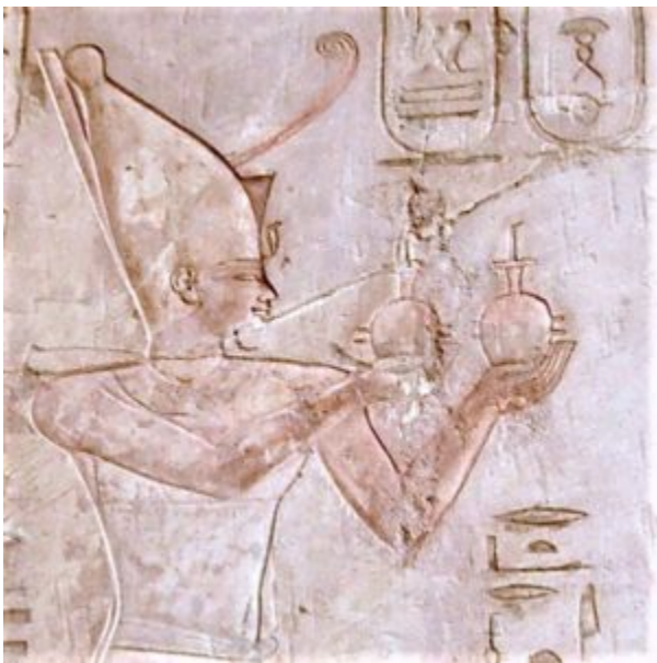
The earliest records of a psychological experiment go all the way back to the Pharaoh Psamtik I of Egypt in the 7th Century B.C.